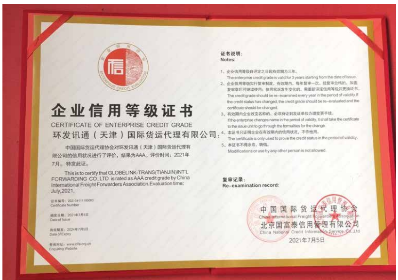
Recent renewed Certificate of Enterprise Credit Grade 2021